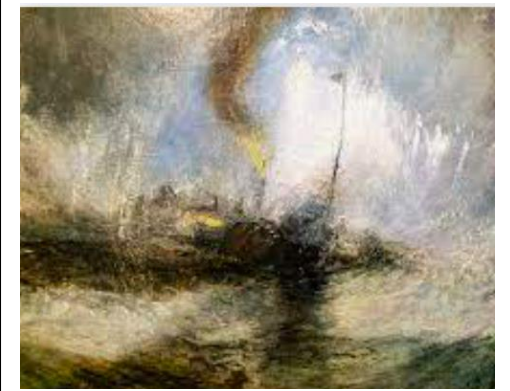
Snow Storm – JMW Turner