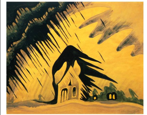
The East Wind – Charles Burchfield

Draw - Artists through the ages have often been inspired by extreme weather conditions. There are some examples here. See what other examples you can find, then draw or paint a picture of extreme weather.