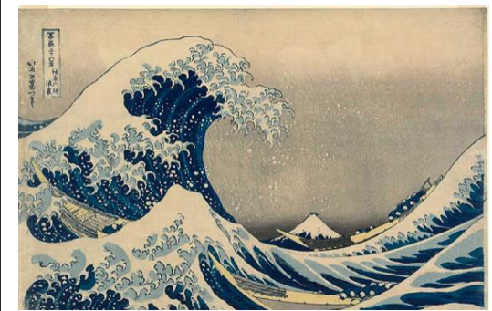
The Great Wave - Katsushika