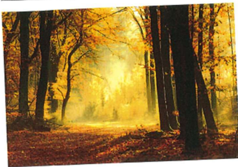
Everywhere I looked, the forest seemed to glow with the colours of autumn.

WALT include a range of autumn vocabulary in my writing.