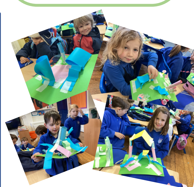
Starfish have been working hard on finding ways to join and fold in DT! Great work all of you, they look amazing!!